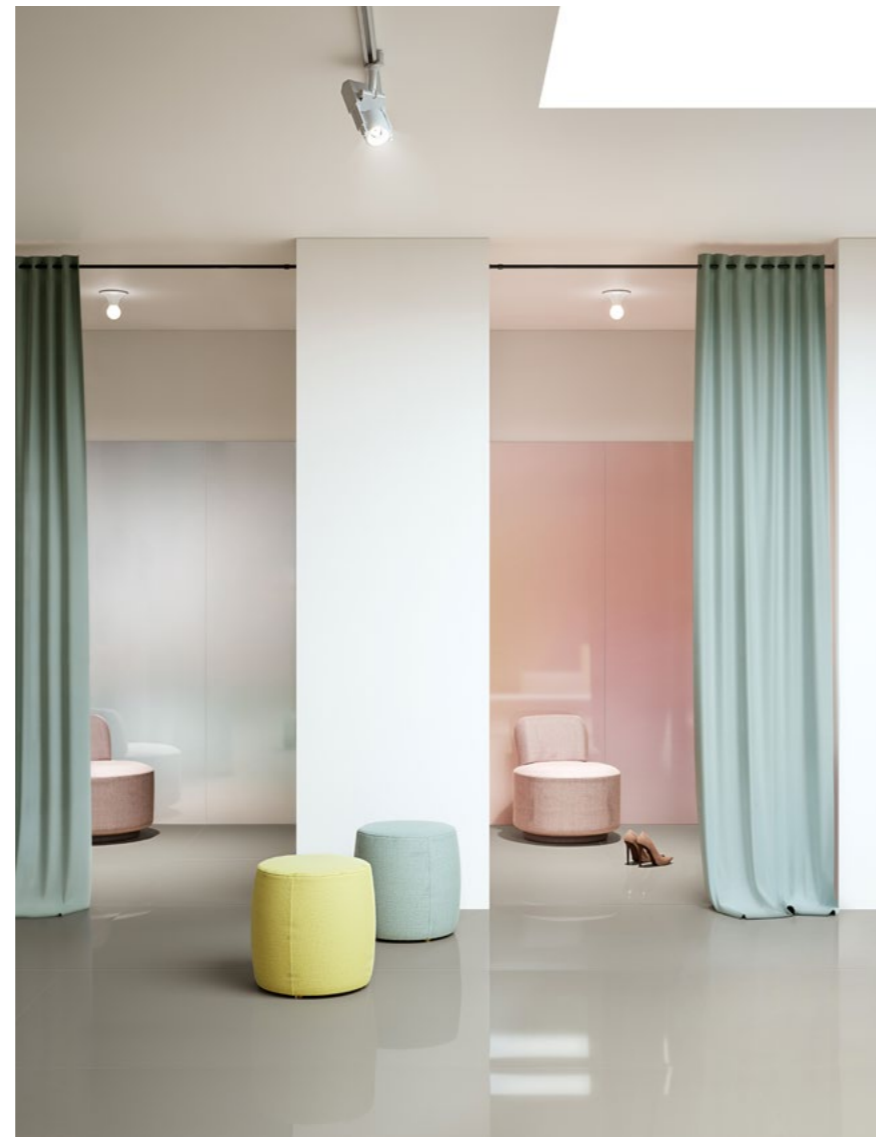
Cromatica collection | Formafantasma for CEDIT – Ceramiche d'Italia | made in Florim

Rainwater, with a subtle purple undertone is a perfect pale grey to bring out the complementary yellow undertones of peachy New Dawn and green Celadon. The heavy tint shared by this trio makes for naturally airy spaces and use on sleek surfaces and minimal design.