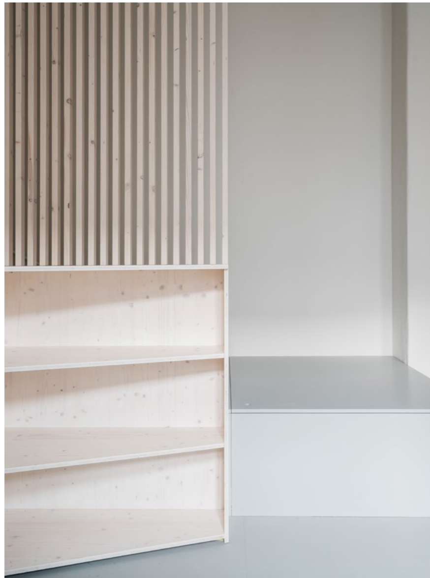
BATEK ARCHITEKTEN